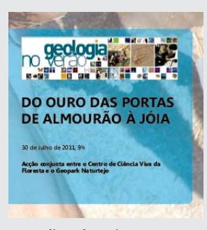
Leaflet for the event Geology in the Summer «Do Ouro das Portas de Almourão à Jóia»